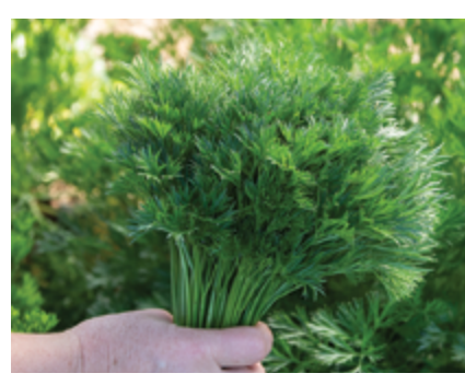
MENUETTE Parsley | #4651 Delicate texture for garnishes, plus easier kitchen prep.