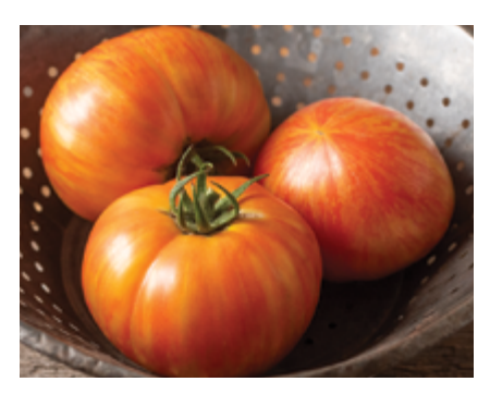
HOT STREAK Tomato | #4760 EXCLUSIVE! Delicious red fruit with yellow striping. For field or tunnel.