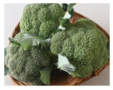
KARIBA Broccoli | #4642 Adaptability plus cold tolerance for reliable fall/winter production.