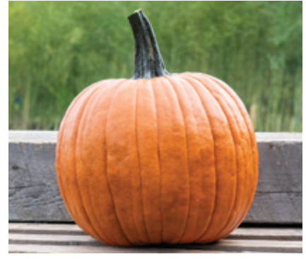
THE BOSS Pumpkin | #4419 Clearly in charge, with traditional ribs and a vibrant color. Bred by Johnny's.