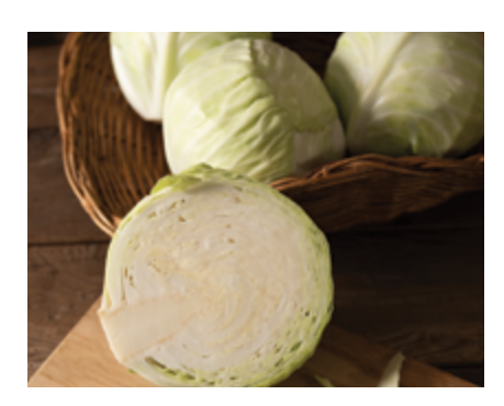
PROMISE Cabbage | #4037 Juicy, tender, and sweet, even after long-term storage.