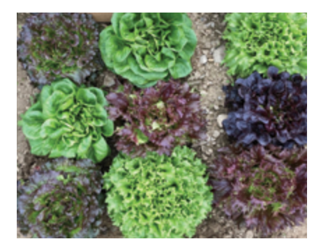
PRISMATIC MINI HEAD MIX Lettuce #4768JP (Pelleted) EXCLUSIVE! Stunning mix of colors, leaf shapes, and textures.