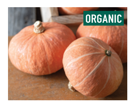
MARMALADE Winter Squash | #4424G Beautiful 2–3 lb., coral-colored kabocha. Bred by Johnny's.