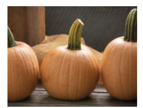
HOT CHOCOLATE Pumpkin | #4467 Distinctive caramel color complements autumn floral displays.