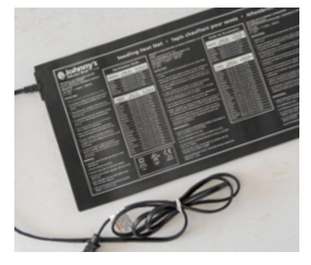
JOHNNY'S SEEDLING HEAT MATS #6272 EXCLUSIVE! For seed germination and plant propagation.