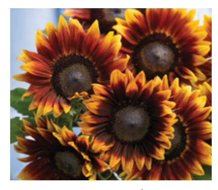
SHOCK-O-LAT Sunflower | #4731 Chocolatey blooms brushed with gold. 4–6"-wide flowers on 12–24" stems.