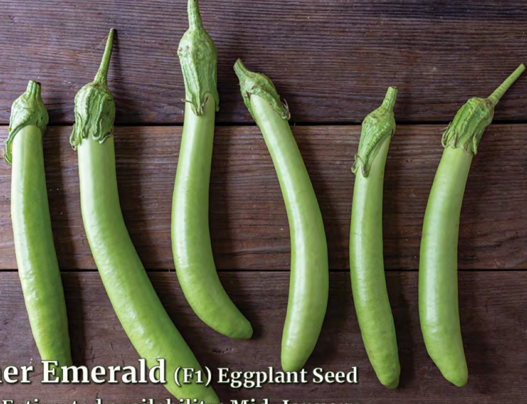
Summer Emerald (F1) Eggplant Seed 65 Days | Estimated availability: Mid-January