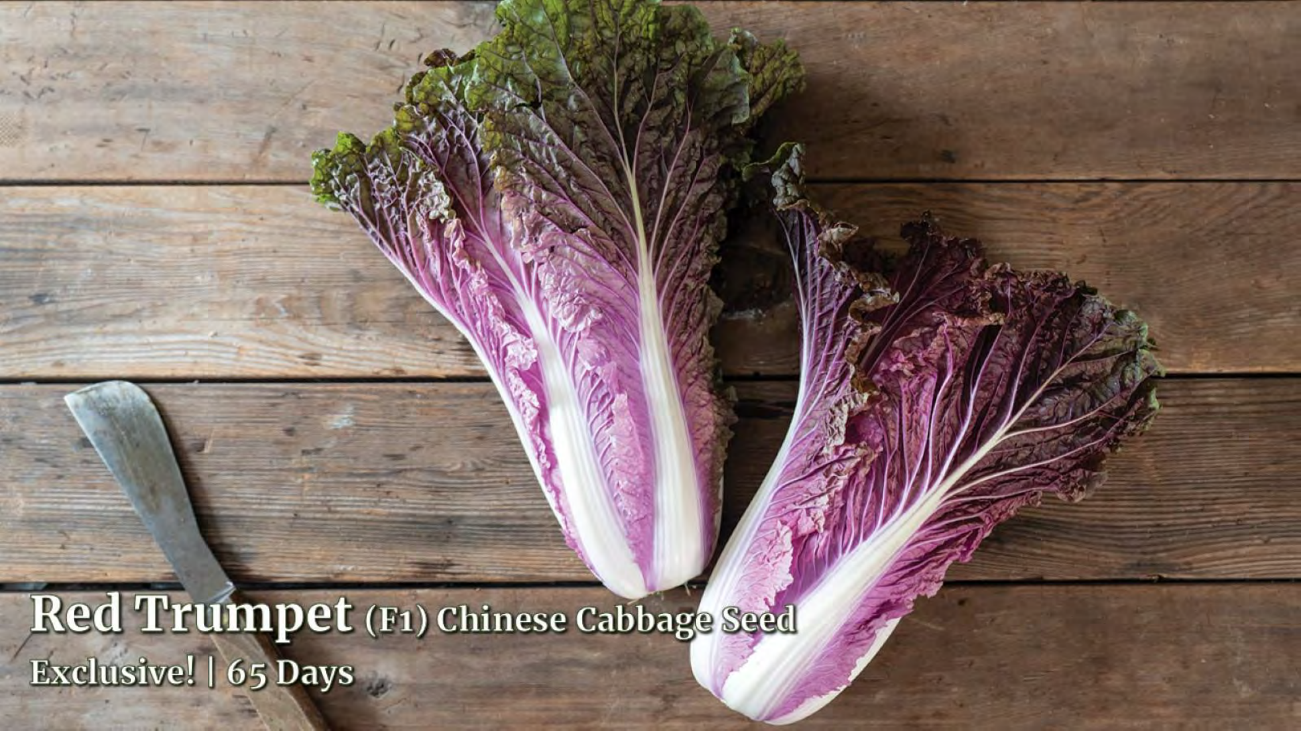
Red Trumpet (F1) Chinese Cabbage Seed Exclusive! | 65 Days