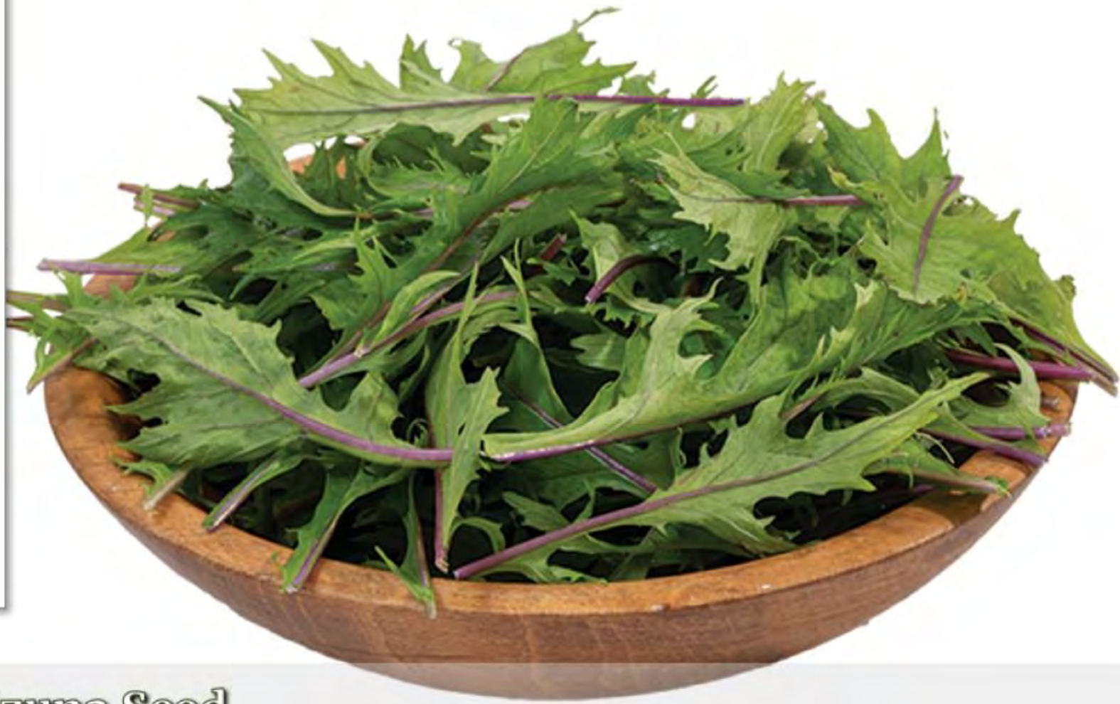
Ember Mizuna Seed First-to-Market | 21 Days