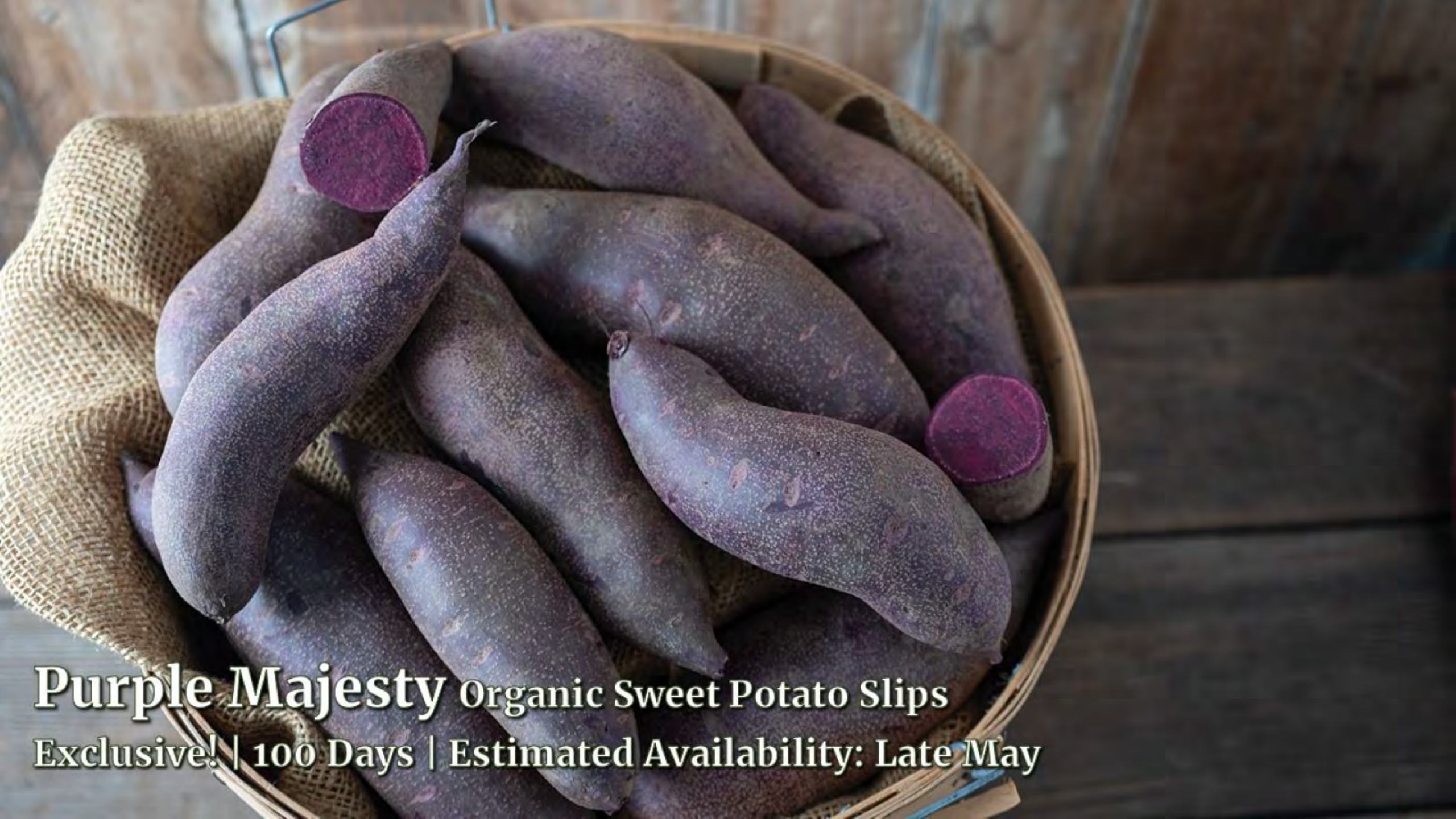
Purple Majesty Organic Sweet Potato Slips Exclusive! | 100 Days | Estimated Availability: Late May