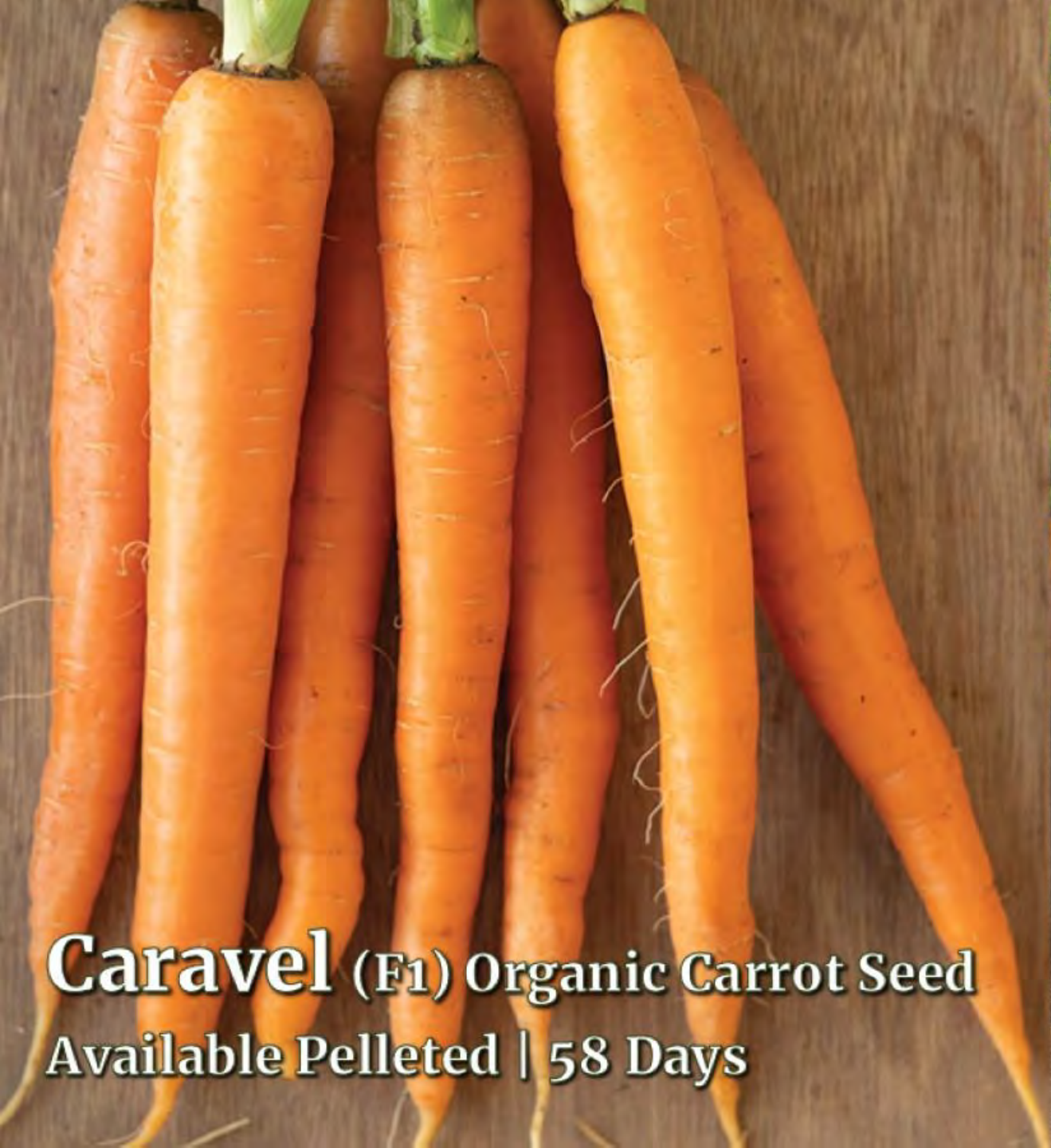
Caravel (F1) Organic Carrot Seed Available Pelleted | 58 Days