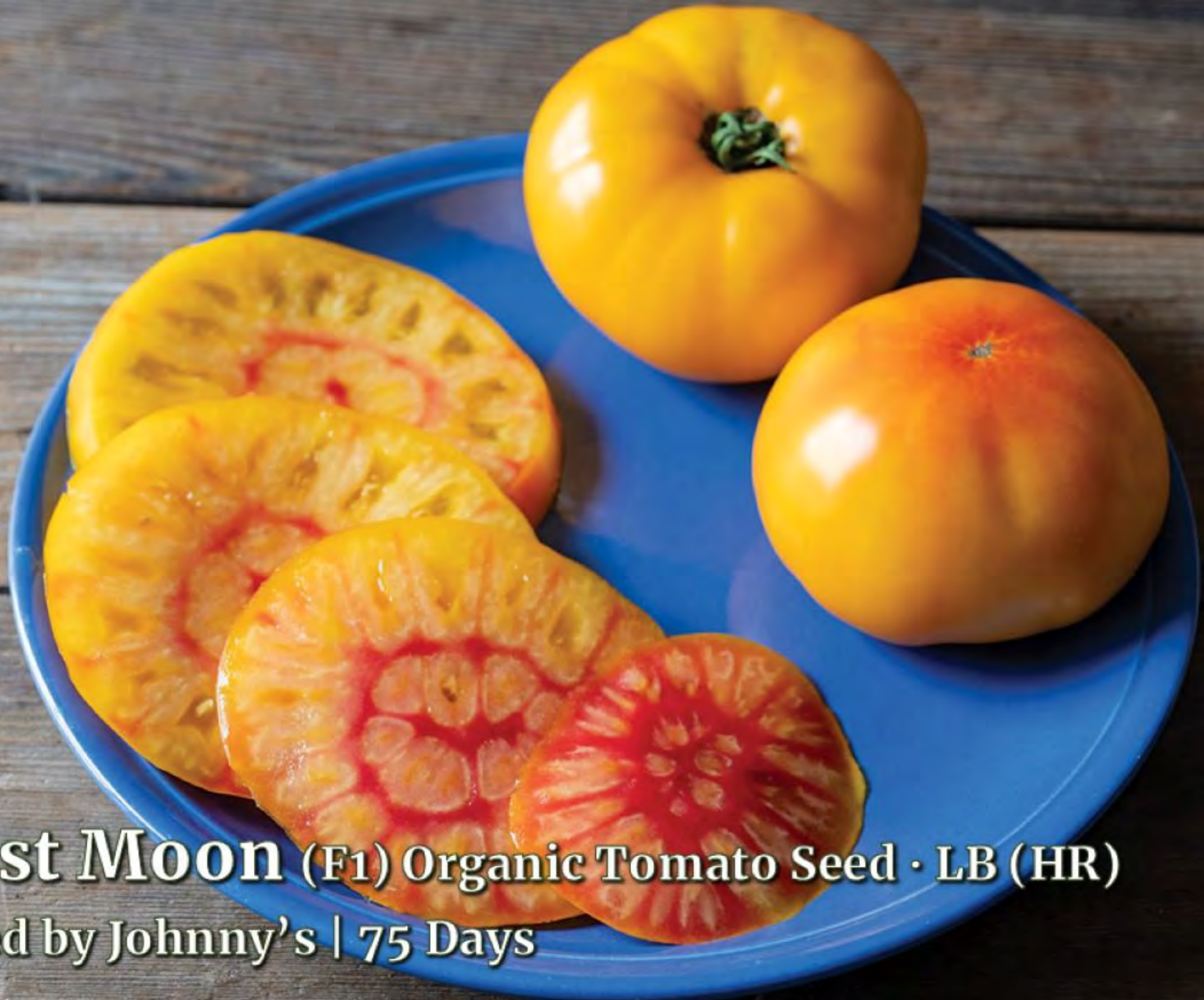
Harvest Moon (F1) Organic Tomato Seed · LB (HR) Developed by Johnny's | 75 Days