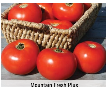
Mountain Fresh Plus