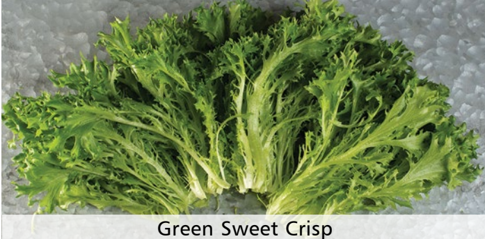
Green Sweet Crisp