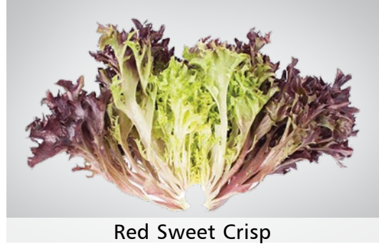
Red Sweet Crisp