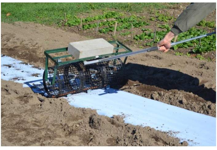
REV 11/01/2016 RC, MN