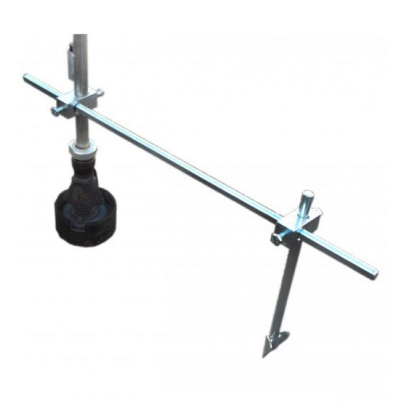
7068 Adjustable Distance Marker