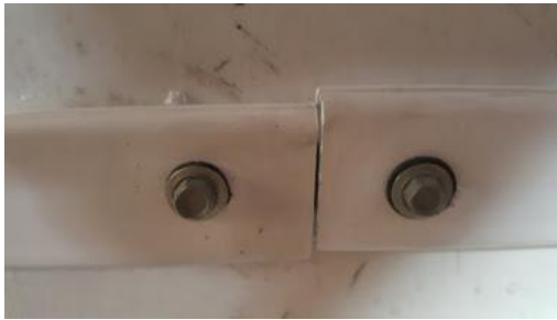
Damage from misaligned connectors.