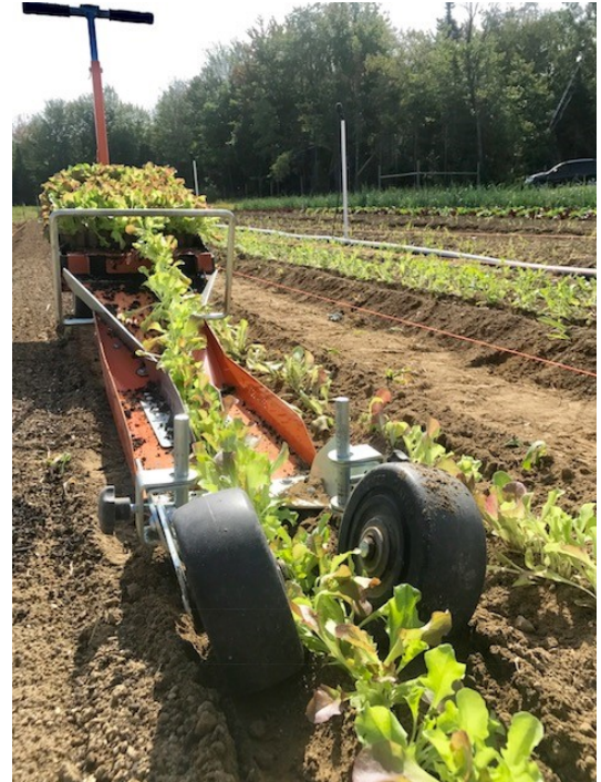
Planting greens at our Tools Trial Garden in Albion, Maine.