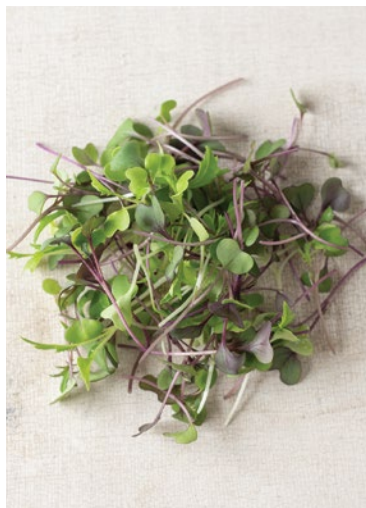
Mild Micro Mix