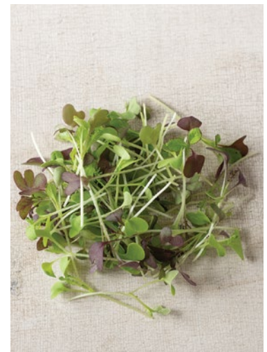
Spicy Micro Mix