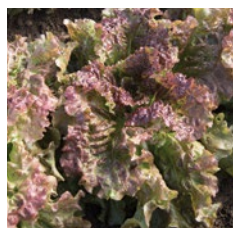
New Red Fire