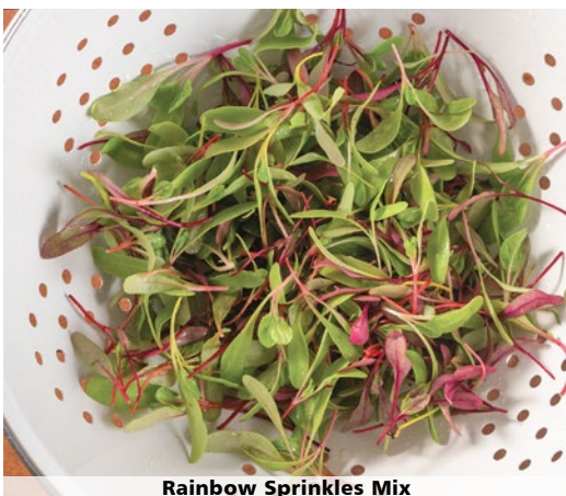
Rainbow Sprinkles Mix

☞ — all microgreens are suitable for hydroponic growing