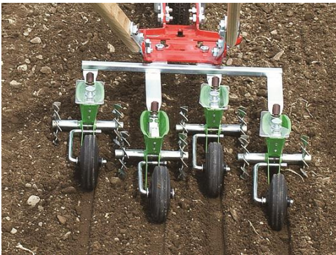
Four Glaser Seeders attached to a Glaser Wheel Hoe, using the accessories shown to the left.