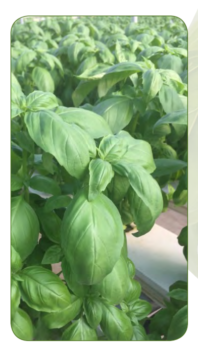
Aroma 2, grown hydroponically