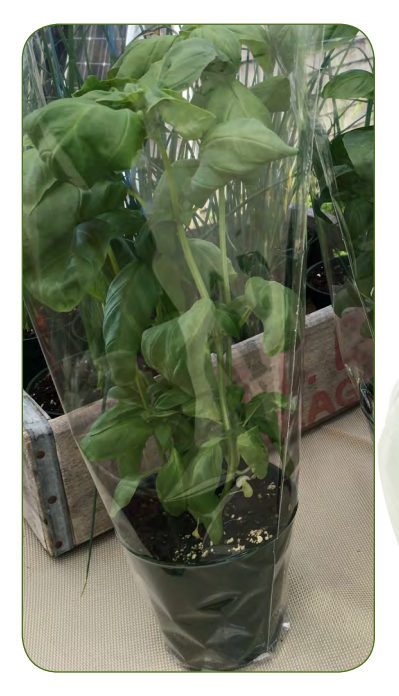
Basil plant ready for market, protected by cut-flower sleeve