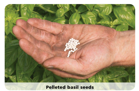
Organic Seeds/NOP-Compliant Pellets

Please refer to our <u>Precision Vacuum Seeder</u> <u>Trial Results: Plate Recommendations for Herbs</u> (XLSX). For best results, ensure consistent soil moisture during the germination period. Pelleted seed must be kept cool and dry prior to planting, and should be used within one year of purchase.