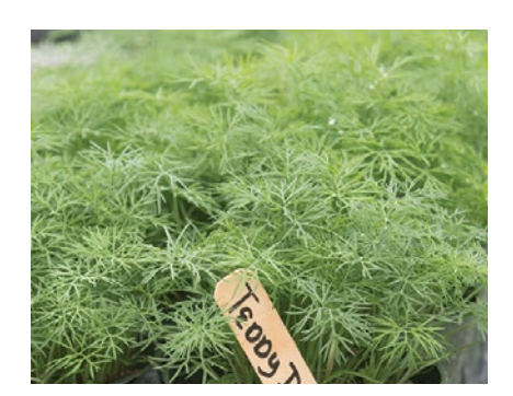
TEDDY Dill | #3293 Productive, slow-bolting dill with lush appearance.