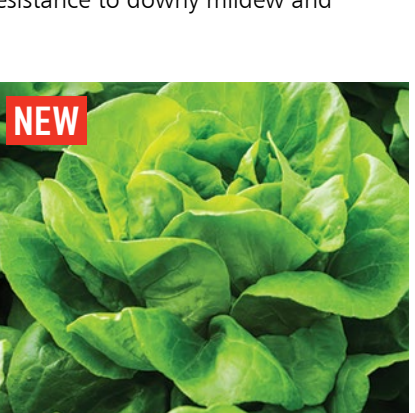
CASEY Lettuce | #4623P (Pelleted) Improved butterhead for CEA summer slot.