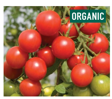
SAKURA Tomato | #3853G Delicious, early cherry with exceptional disease resistance.