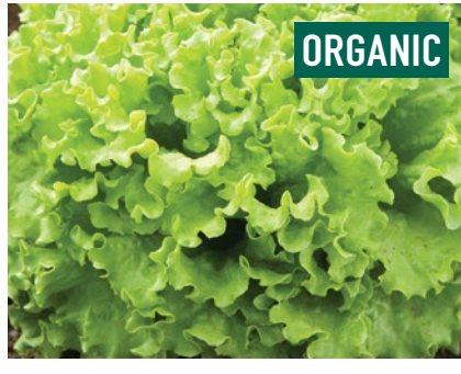
MUIR Lettuce | #3881GP (Pelleted) Extremely heat tolerant and slow to bolt.