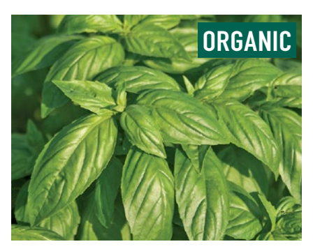
PROSPERA® DMR (CG1) Basil |#3597G Fast-growing Genovese type with excellent disease resistance.