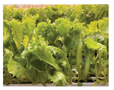
LALIQUE Lettuce | #4184JP (Pelleted) Crunchy, sandwich-leaf type with strong performance.