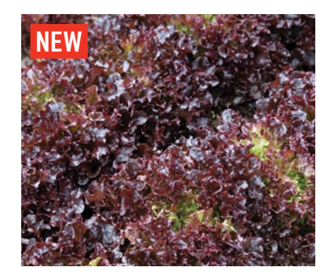
SALANOVA® RED TANGO Lettuce #4764JP (Pelleted) EXCLUSIVE! Slowest bolting of all our one-cut lettuces.