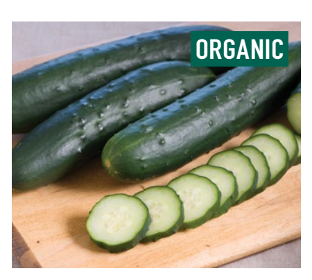
CORINTO Cucumber | #2562G EXCLUSIVE! Early, productive slicer with remarkable vigor.