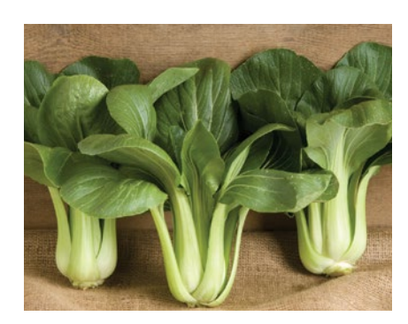
BLACK SUMMER Pac Choi | #2460 EXCLUSIVE! Dark green leaves with broad, light green petioles.