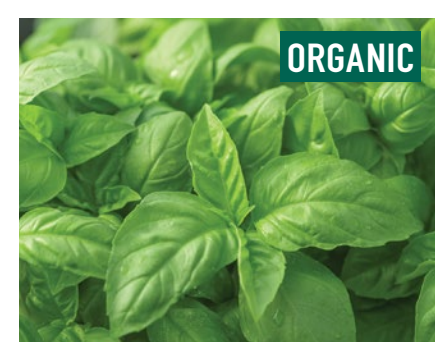
PROSPERA® ITALIAN LARGE LEAF DMR (ILL2) Basil | #4589G EXCLUSIVE! Resistant to downy mildew & Fusarium.