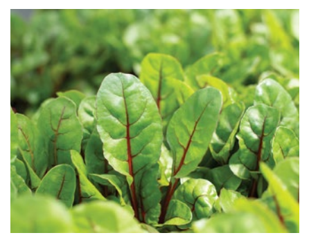
CHARBELL Swiss Chard | #4551 Clean, vibrant leaves. Strong Cercospora resistance.