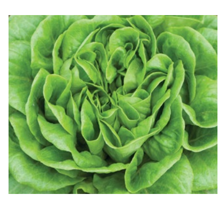
SALANOVA® HYDROPONIC GREEN BUTTER Lettuce | #4188JP (Pelleted) EXCLUSIVE! Improved tipburn tolerance.