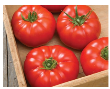
MARBONNE Tomato | #3225 EXCLUSIVE! Marmande type with improved disease resistance and vigor.