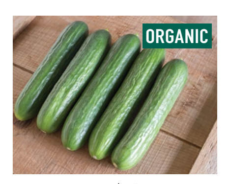
KATRINA Cucumber | #47G Tasty snacking cucumber with good heat tolerance.