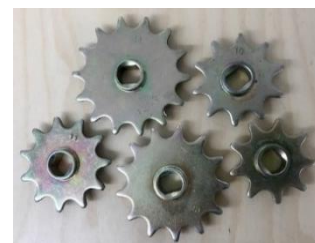
Assorted Jang Sprockets.

Each Jang JP Series Seeder comes with a set of 6 numbered sprockets (#9, #10, #13, #14, and two #11) to adjust your seed spacing. The number correlates with the number of teeth on each sprocket. To operate your Jang JP Series Seeder, a sprocket must be mounted onto each of the drive shafts located both at the front and the rear of the gear box with a chain connecting the two.