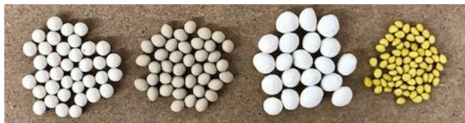
Different sizes and shapes of pelleted seeds.

Note: Some roller types have the same size holes, but the depths are different. For example, an R roller and a G roller both have 9mm diameter holes, but the G roller is a little deeper.