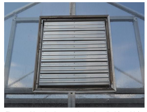
Figure 2: Motorized power shutter installed (outside).