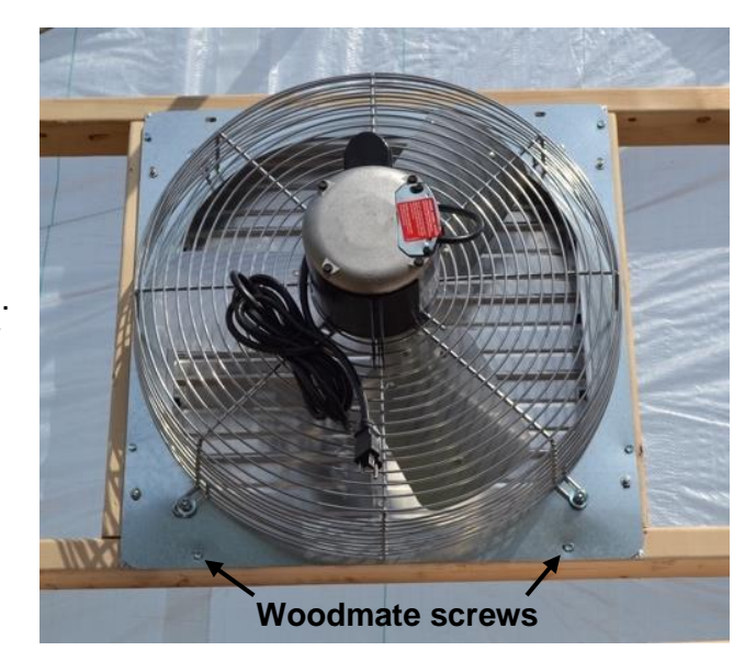
Figure 1: Exhaust shutter fan installed.

Note: Be sure to create a drip loop with the electrical cord to prevent water from entering the thermostat housing.