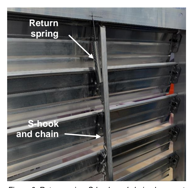
Figure 6: Return spring, S-hook, and chain placement.