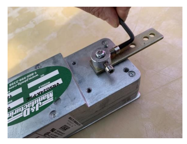
Figure 3: Attaching the motor arm to the motor drive shaft.