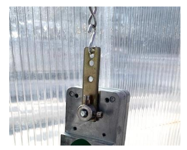
Figure 7: Attaching the S-hook and chain to the mounting arm.