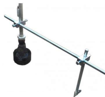
7068 Adjustable Distance Marker