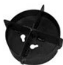
7074 Cross-Cut Die, 5.1" x 5.1"