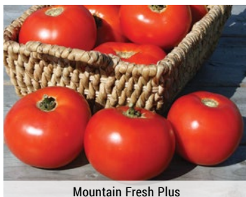
Mountain Fresh Plus