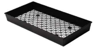
Medium Weight Mesh