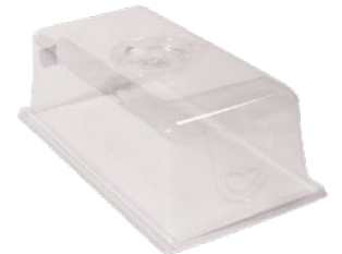
Large 7" Clear Propagation Dome