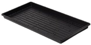
Shallow Black Germination Tray