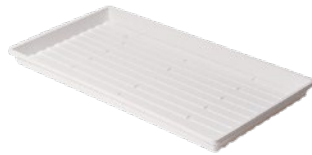
Shallow White Leakproof Tray