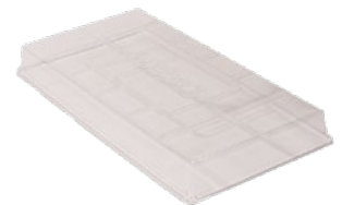
2" Clear Acrylic Dome

* Dome rests lightly over the tray and does not form a tight seal. ** Pro-Tray Propagation Flats are only compatible with domes if using a support tray underneath.