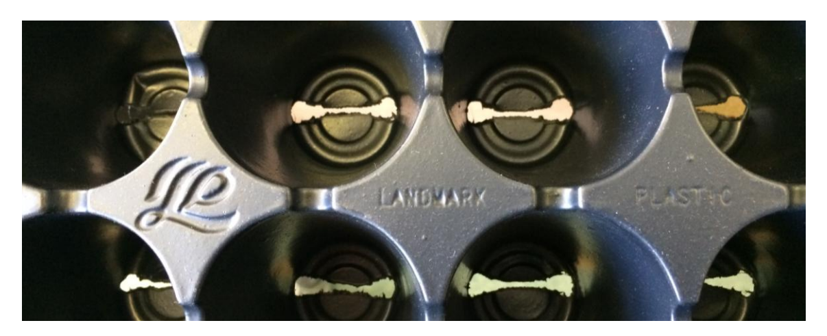
Copyright © 2016 Johnny's Selected Seeds. All rights reserved.

Landmark Plastic brand trays have a cursive L logo and usually "Landmark Plastic" embossed on them.