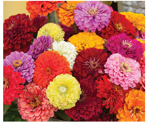
'Benary's Giant Mix' Zinnia