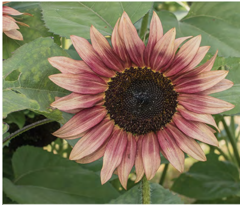
'Strawberry Blonde' Sunflower