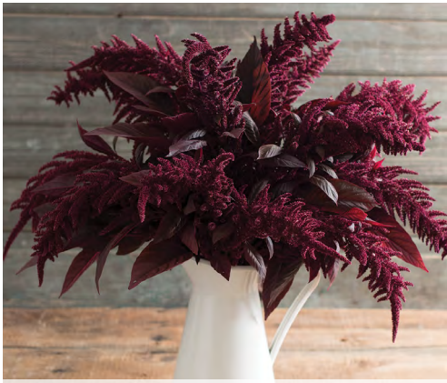
'Red Spike' Amaranthus