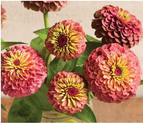
'Queeny Red Lime' Zinnia