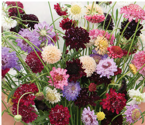
'Pincushion Formula Mix' Scabiosa