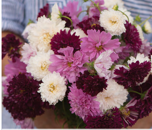
'Double Click Mix' Cosmos