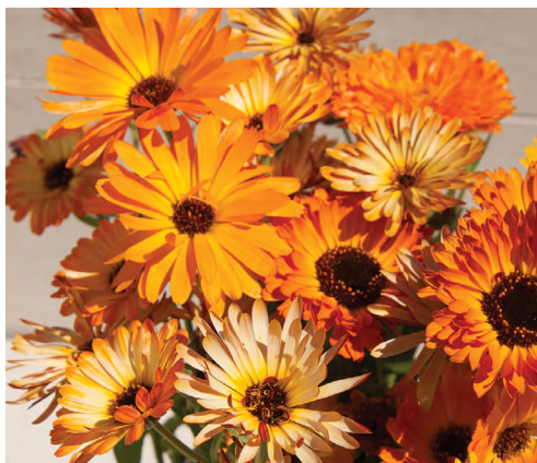
'Flashback Mix' Calendula