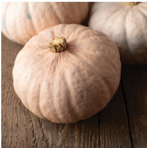
Winter Blush (F1)

For more information about Johnny's plant breeding program, visit Johnnyseeds.com/research-farm