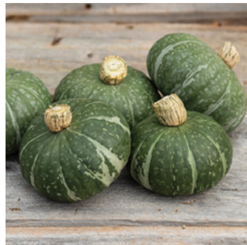
Sweet Jade (F1)