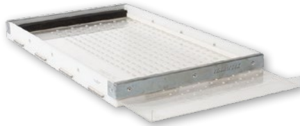
Paperpot Seeder Frame 7953

Drop seeder system comprised of interchangeable plates that sit within a frame. Clear plexiglass plates for easy alignment over Paperpot cells. Only compatible with 264 cell Paperpot trays and chain pots. Frame and plates sold separately.