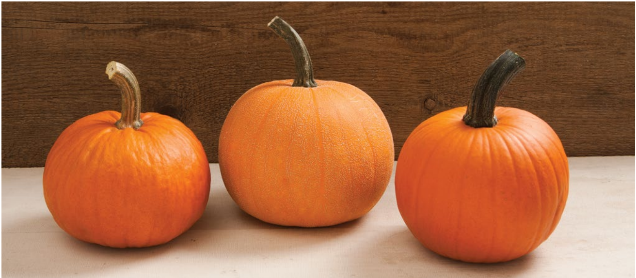
New England Pie