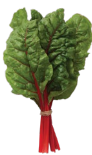
Ruby Red or Rhubarb Chard