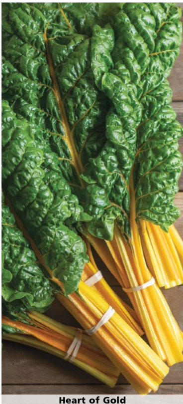
Heart of Gold

D =Developed by Johnny's OG =Organic Seed