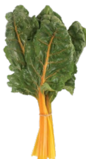
Heart of Gold