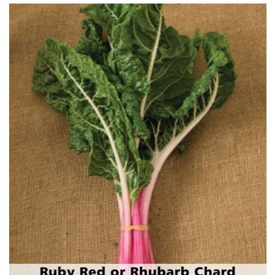
Ruby Red or Rhubarb Chard