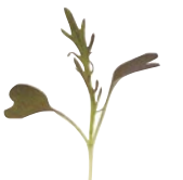
Mustard, Ruby Streaks