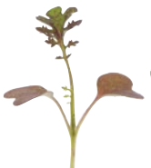
Mustard, Scarlet Frills