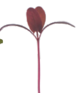
Orach, Ruby Red