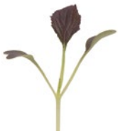
Mizuna, Red Kingdom