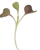
Mustard, Garnet Giant