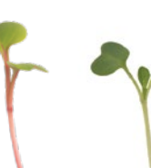
Radish, Red Stem