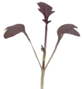
Mustard, Miz America