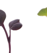
Radish, Red Rambo