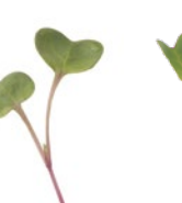
Radish, Hong Vit