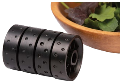
Baby Leaf Seed Roller Pack

EXCLUSIVE! Includes one of each Jang roller: MJ-24 and L-24. Sows approximately 2–3 seeds per drop at your desired spacing between 0.5–2.5" apart for seeding baby leaf spinach.