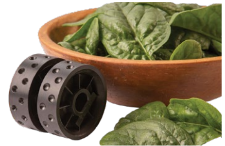
Spinach Seed Roller Pack