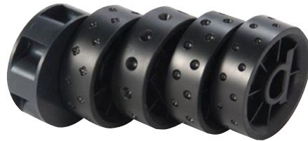
Seed Roller Starter Pack

Includes one of each Jang roller: X-24 (brassicas, baby greens, and raw onion), F-24 (radish), LJ-12 (raw beets, size #13 pelleted beets, carrots, lettuce, and onion), XY-24 (raw carrots and lettuce), and N-6 (small beans and corn).