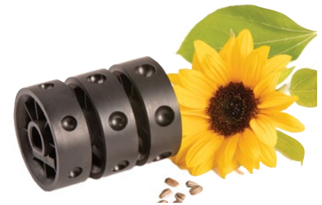
Sunflower Seed Roller Pack