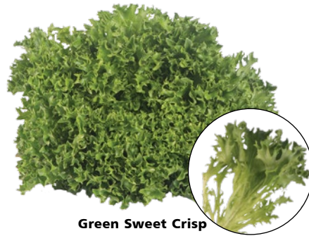
Green Sweet Crisp