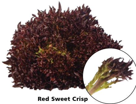
Red Sweet Crisp