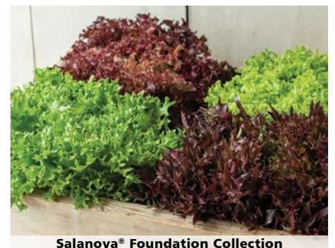
Salanova® Foundation Collection

EXCLUSIVE! Use as a salad mix base for structure, loft, and yield. Can be used as a standalone mix or combined with the Salanova Premier Collection. Includes equal amounts of each of the Sweet Crisp and Incised types. 💧