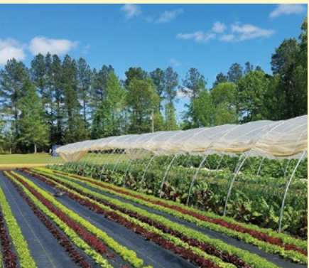
Sunbelt Black Ground Cover