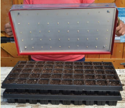
Precision Vacuum Seeder