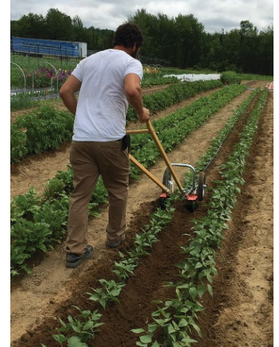
Hilling beans with the Glaser U-Bar Double Wheel Hoe.