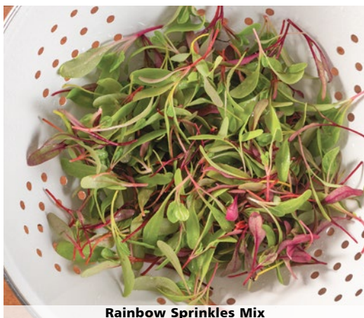
Rainbow Sprinkles Mix

💧 — all microgreens are suitable for hydroponic growing