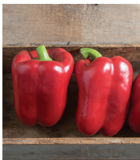
X3R® Red Knight