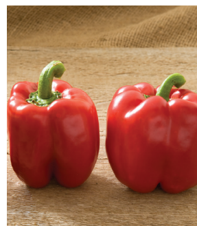
Yankee Bell and Olympus