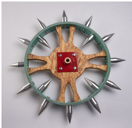
4" Spacing Dibbles on the 4 holes only