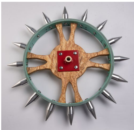
3" Spacing All dibbles on the 3 holes

The Dibbler's strong, aluminum alloy wheels can be easily changed out using a flat-head screwdriver. Store dibbles inward on the wheels when not in use. See basic in-row spacing options below.