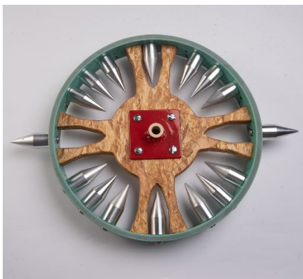
22" Spacing 2 Dibbles on opposite sides