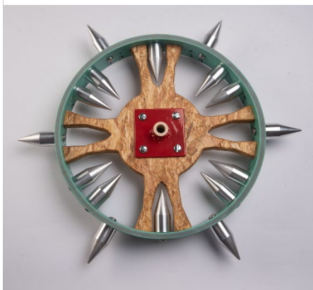
8" Spacing Dibbles on every other 4 hole