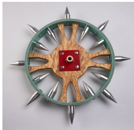
6" Spacing Dibbles on every other 3 hole