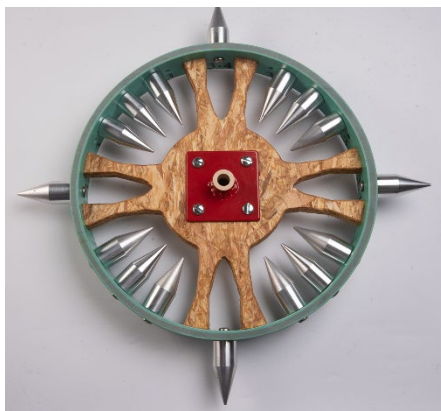
12" Spacing Dibbles on the 4 "corners"