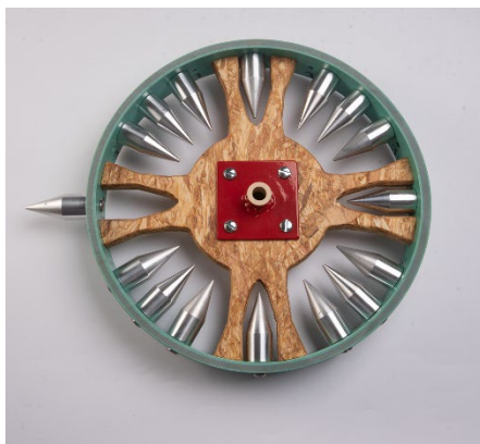
41" Spacing 1 Dibble anywhere

The holes drilled into the plastic wheel hub feature a numbering system for interpreting whether the dibbles are being spaced in 3" or 4" increments.