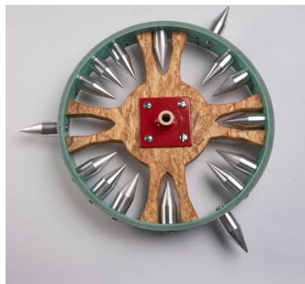
15" Spacing Dibbles on every 4 th 4-3 hole