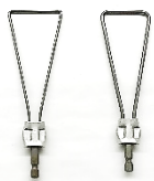
7719 2" Wide, Sharp 7769 2" Wide, Firm