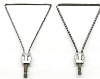
7720 4" Wide, Sharp 7770 4" Wide, Firm