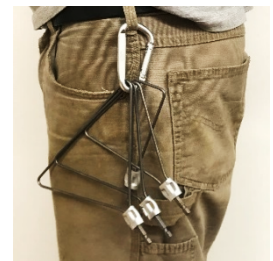
7764 Neversink Farm Pacifist Wire Head Master Kit

Includes all four firm-wired Pacifist Heads plus a carabiner for attaching to your belt loop.