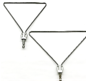
7771 6" Wide, Firm 7772 8" Wide, Firm