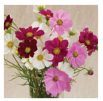
Single blooms in 'Versailles Mix'

Cosmos prefers full sun. It will grow in any type of soil, but choose a plot with good drainage to avoid the risk of root and stem rot. Tall varieties may benefit from wind protection.