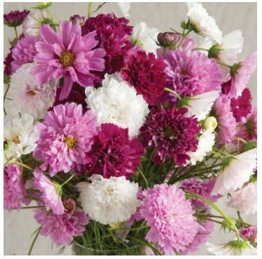
Semi-double and double blooms in '<u>Double Click</u> Mix'