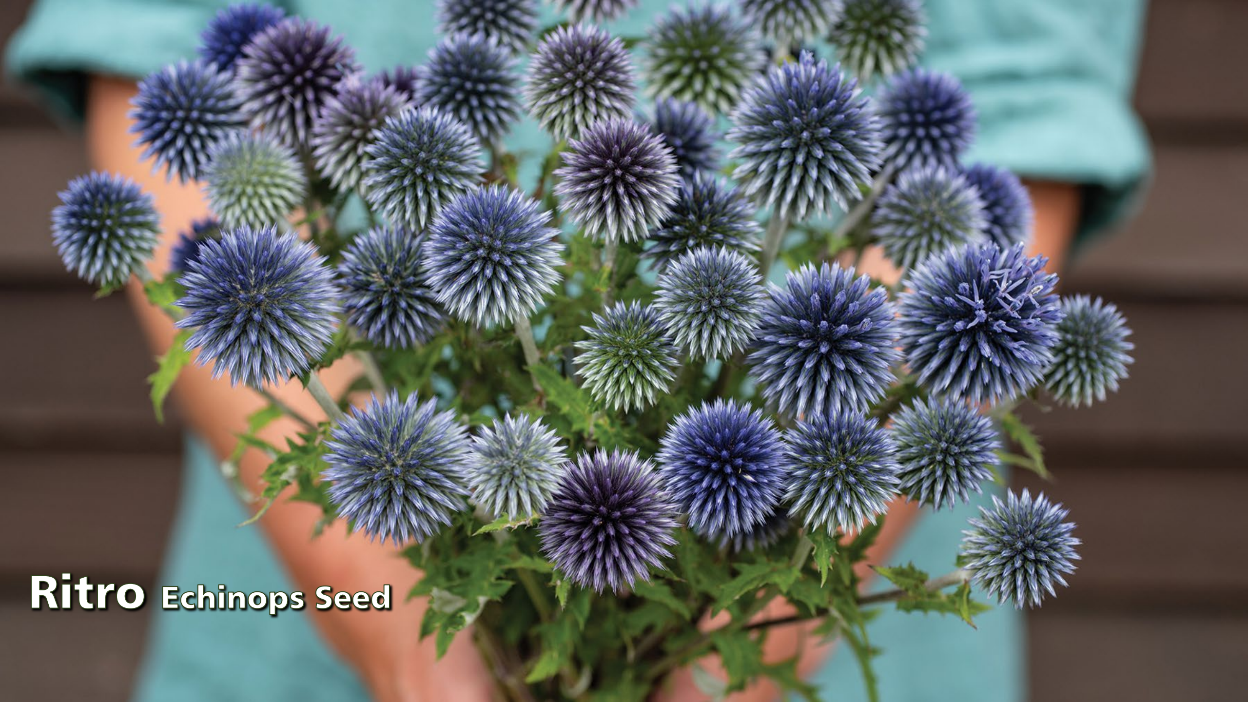
Ritro Echinops Seed