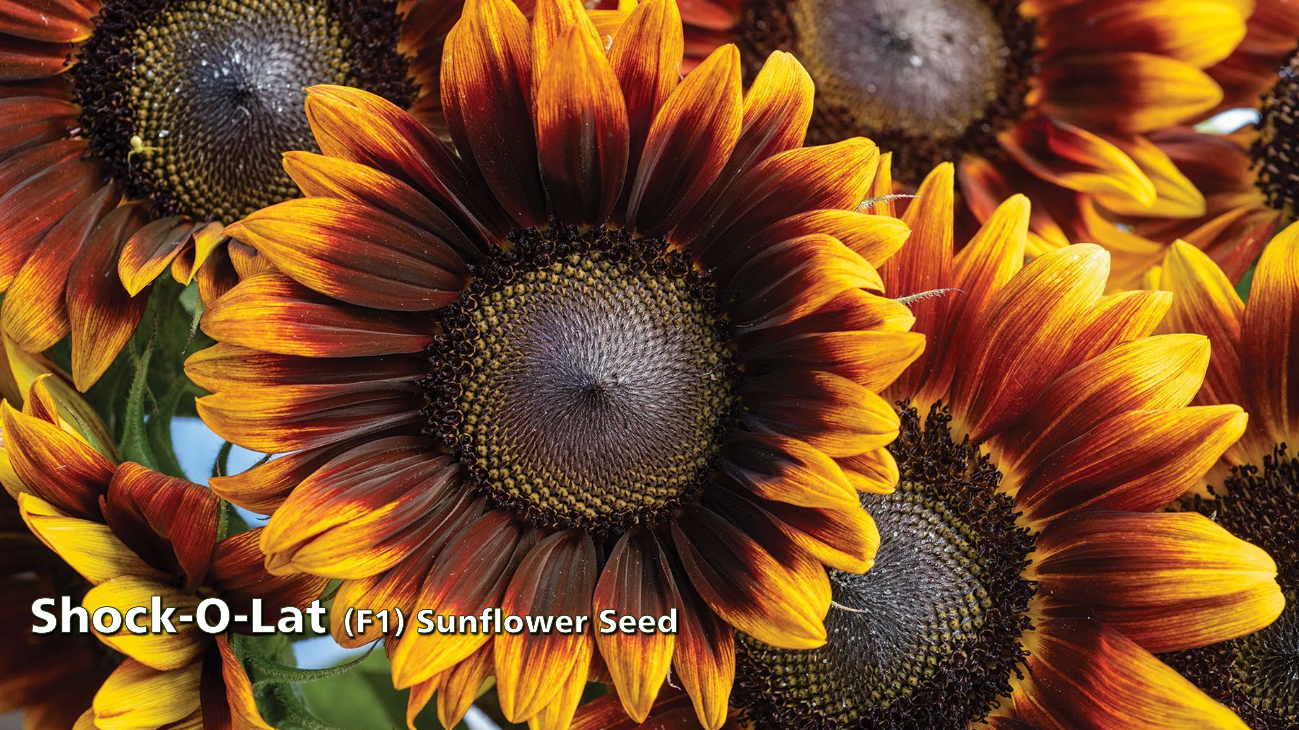
Shock-O-Lat (F1) Sunflower Seed