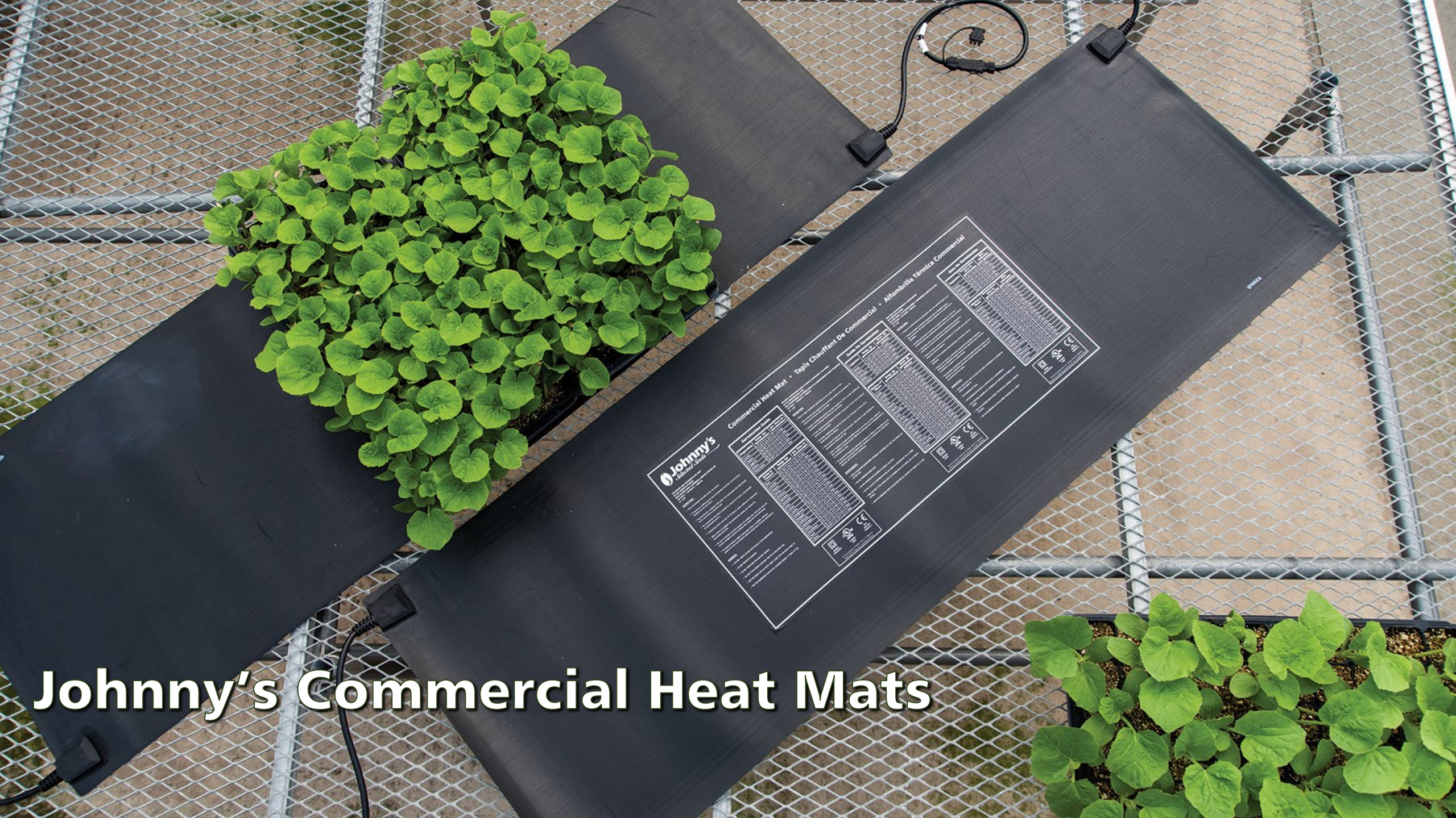
Johnny's Commercial Heat Mats