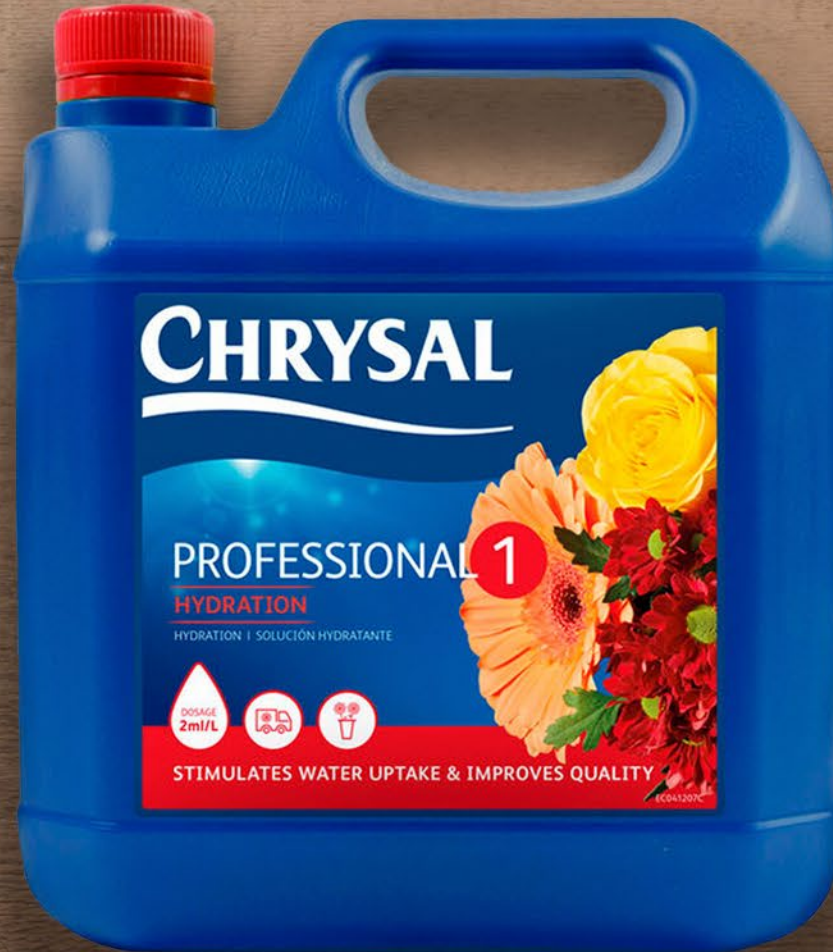
Chrysal Professional 1 Hydrating Solution