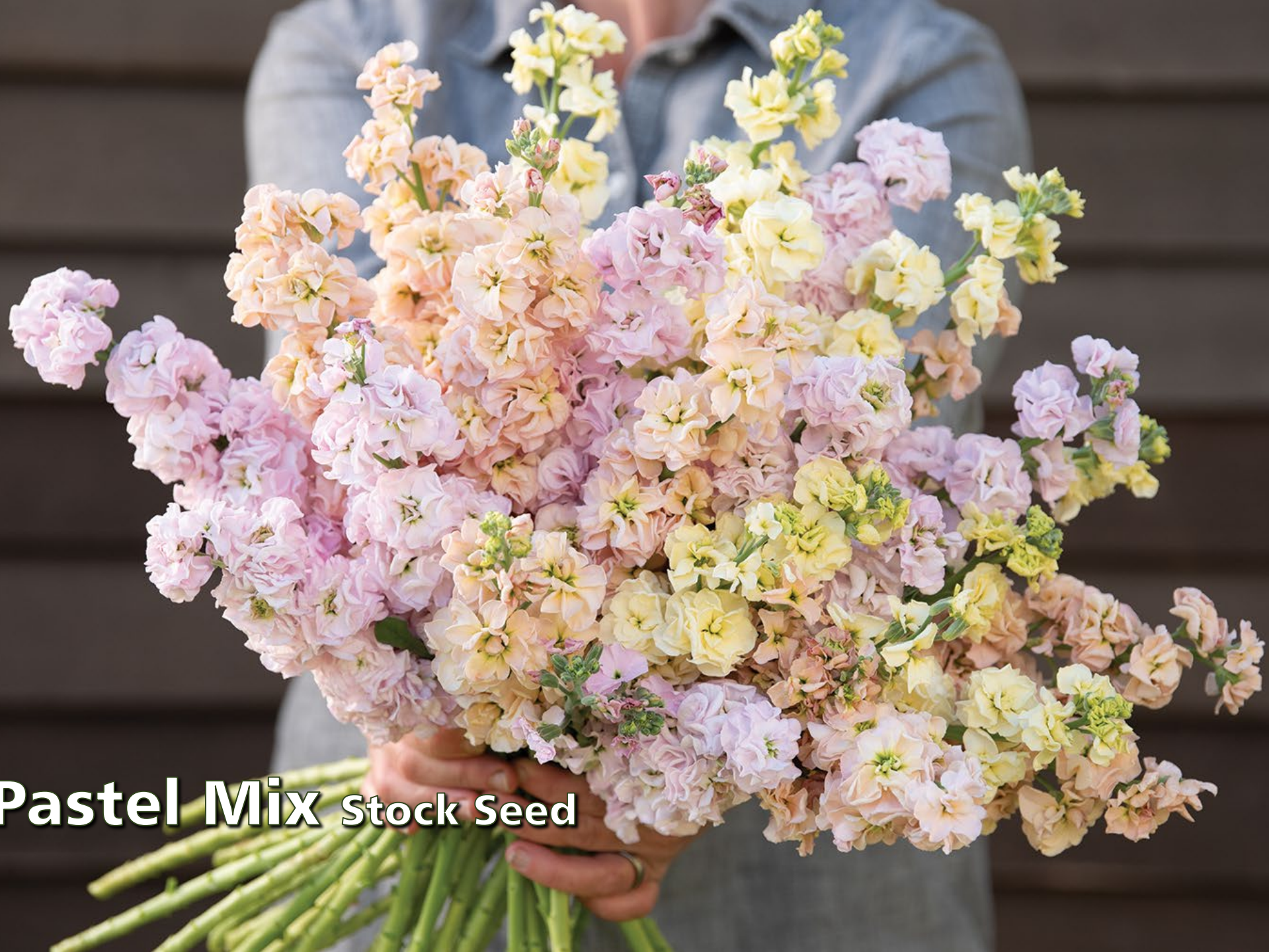
Iron Pastel Mix Stock Seed