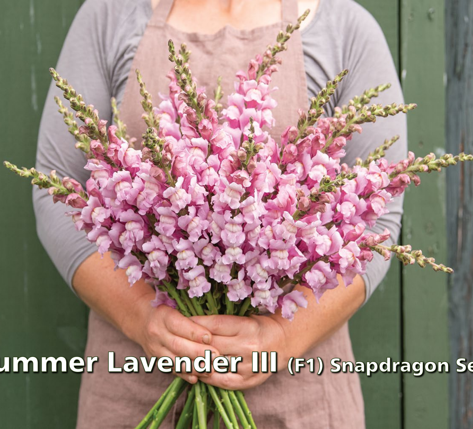
Costa Summer Lavender III (F1) Snapdragon Seed