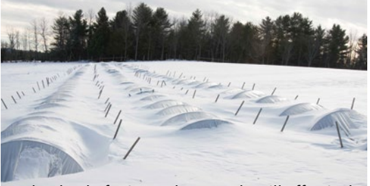
In the dead of winter, the tunnels will effectively be sealed shut by the snow load on top.

After a few frosts, and once the chance of warm days has diminished, a layer of 4-mil (100-micron)-thick greenhouse film can be laid overtop the row cover. If perchance warm weather occurs after the addition of the plastic layer, you may need to manually regulate internal temperatures, ventilating the low tunnels by lifting their sides then lowering them again as temperatures drop.