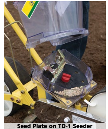
Seed Plate on TD-1 Seeder