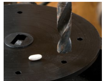
Drilling a #7016 blank plate