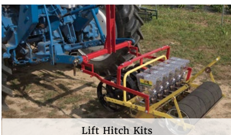
Lift Hitch Kits

Please allow 7-10 business days for delivery. All seed rollers sold separately. See next page.