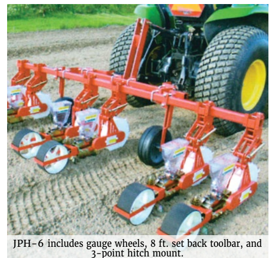
JPH-6 includes gauge wheels, 8 ft. set back toolbar, and 3-point hitch mount.